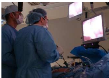
Figure 1. Tobii x50 on a stand under the surgical display. Infrared emissions from the eye tracker are captured in visible light photography as bright dots.

surgeon himself and by another while watching the videos will give us a chance to examine the mental connection to the task and give a cue to their sense of team cooperation.