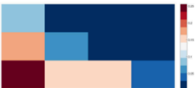
Cluster 2. Right-wing Defensemen.