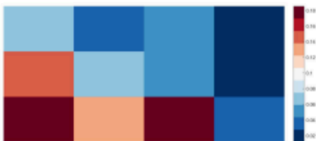
Cluster 11. Right-wing Defensemen with offensive orientation.