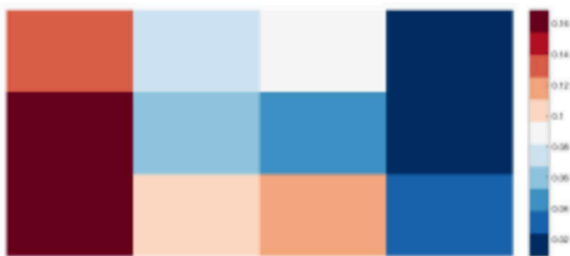
Cluster 10. Defensemen playing on both wings, with a preference for the right.